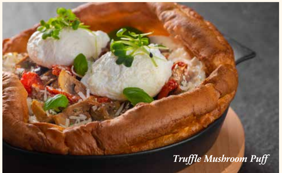
Truffle Mushroom Puff

Two poached eggs served with Hollandaise sauce, a side salad and hash brown potato with your choice of: Beef Bacon Benedict 6.20 Salmon Benedict 🌱 6.90